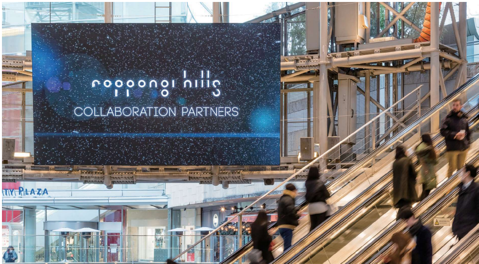
METRO HAT VISION

Situated above the symbolic Roppongi Hills gateway which boasts the highest traffic of incoming visitors, this media enjoys superb exposure and is one of the few large-scale color displays of its kind in Japan. From the escalator, it delivers both high visibility and attention rates.