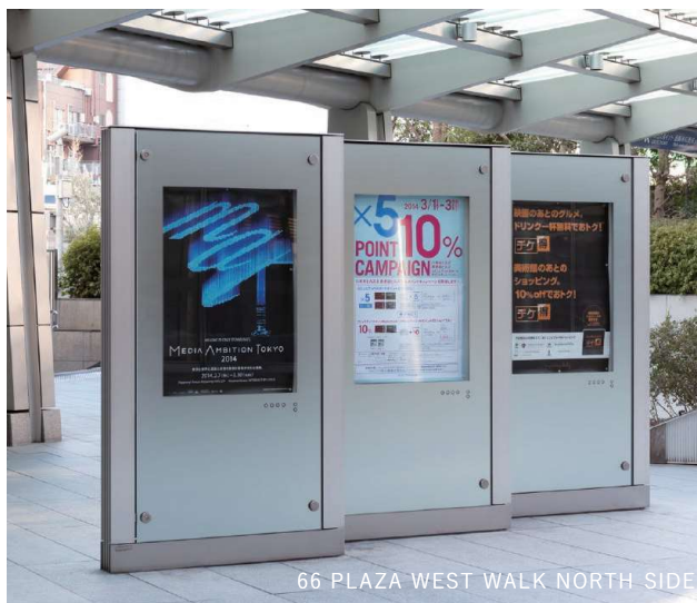
66 PLAZA WEST WALK NORTH SIDE