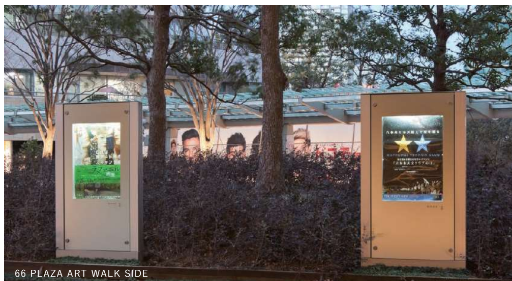
66 PLAZA ART WALK SIDE