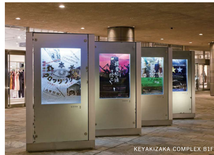
KEYAKIZAKA COMPLEX B1F