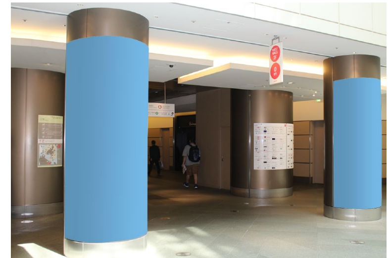
▲South Side Pillar Wrap