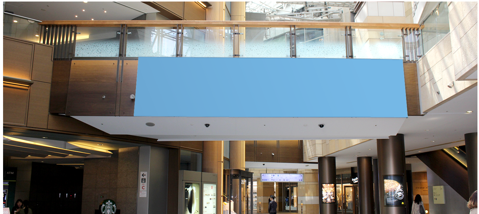
▲Facing the North side 3F bridge