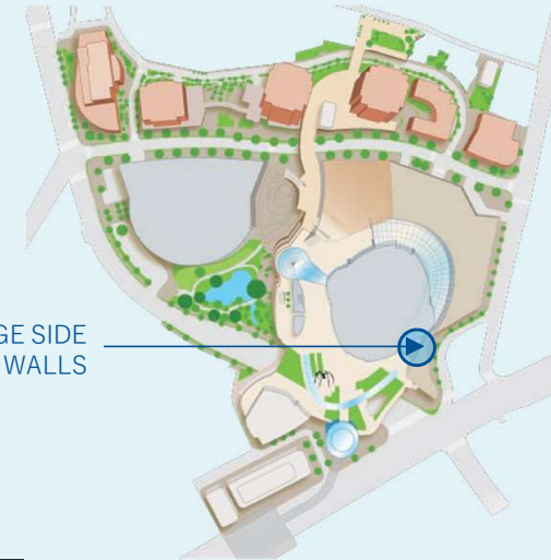
NORTH SIDE 3F BRIDGE SIDE NORTH SIDE WALLS