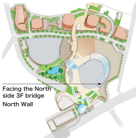
Facing the North side 3F bridge North Wall