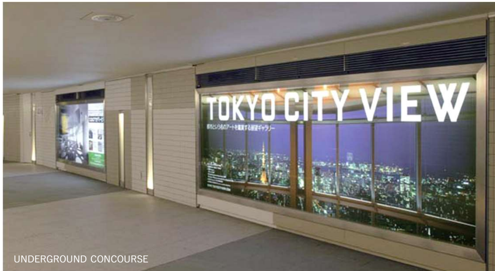
UNDERGROUND CONCOURSE BACKLIT AD BOXES

These large-size media are strategically located in the underground concourse connecting Roppongi Hills and Roppongi Station (Tokyo Metro Hibiya Line). Since its opening in 2003, the concourse has been a gateway for not only the thousands of visitors who come to enjoy the multitude of attractions offered by Roppongi Hills including the observation deck, art museum, conference facilities, hotel, movies, shopping, dining, and events, but also the many office workers and residents. Placement of a high-impact visual in these media can effectively raise awareness and interest in a promoted product or service.