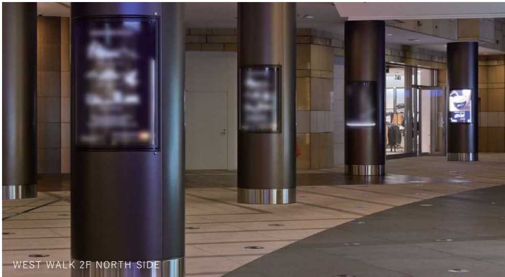
WEST WALK 2F NORTH SIDE

Almost 100 backlit ad boxes and ad poster boards are positioned in locations throughout Roppongi Hills, attracting the eyes of passers-by with vivid visuals and causing many to stop and take a look.